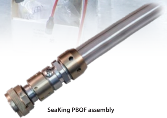
SeaKing PBOF assembly